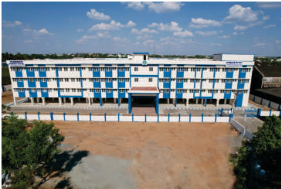
The Hon'ble Chief Minister inaugurated the Workers' Hostel in Kurichi Industrial Estate, Coimbatore District at a Project Cost of Rs. 37.75 Cr. on 25.03.2025