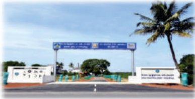
Vandampalai Industrial Estate, Thiruvarur