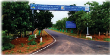
Kadampuliyur Industrial Estate, Cuddalore