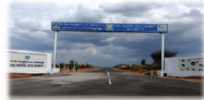
Lingampatti Industrial Estate, Thoothukudi