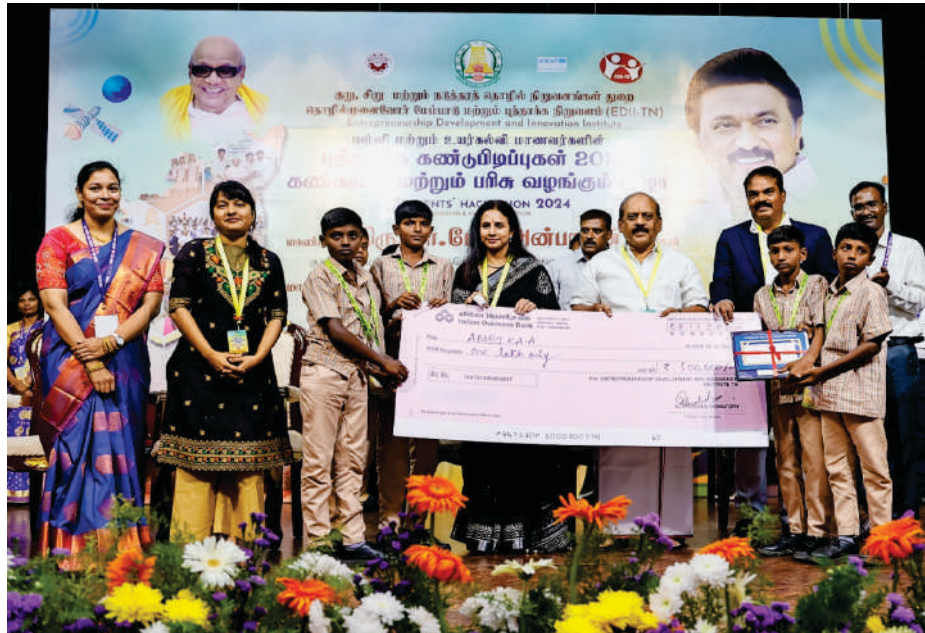
The Honourable Minister for Micro, Small and Medium Enterprises presented the awards to the winners of the School Innovation Development Project at the Demo Day event held at Anna University, Chennai, on 11.11.2024.