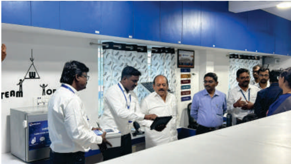
The Honourable Minister for the MSME participated in an event organised by the StartupTN Coimbatore Regional Hub and interacted with startups on November 7, 2024.