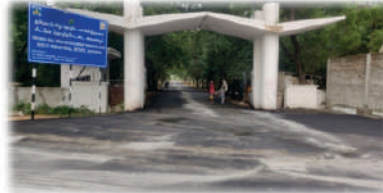
Vaiyavur Industrial Estate, Kancheepuram