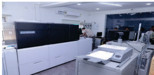
Hon'ble Minister for MSME inaugurated Common Facility Centre for Photography Cluster created under MCDP Scheme on 09.09.2024 at a Project Cost of Rs. 6.29 Cr. in Maraimalai Nagar, Chengalpattu District